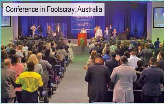
Conference in Footscray, Australia

ple in the church have risen up to continue attending services, work with new converts, and join together in prayer. God has brought new families into His church, and others have made the decision to return to church after a long period of time.