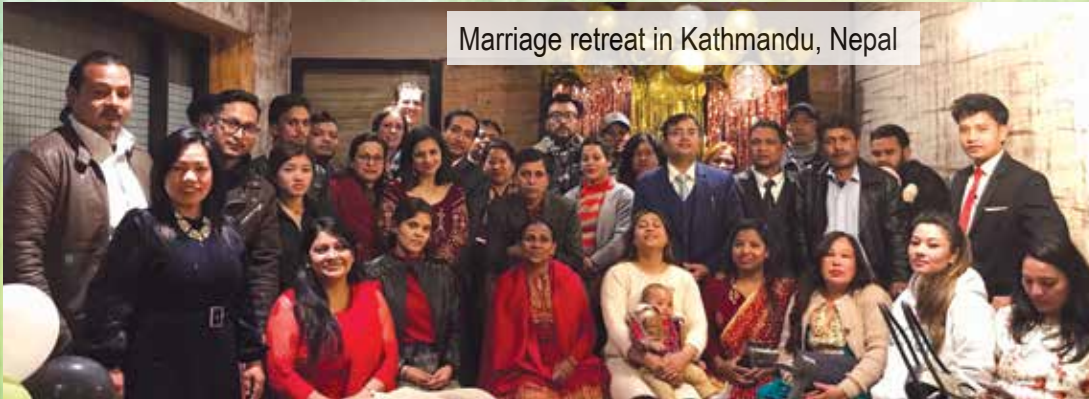
Marriage retreat in Kathmandu, Nepal

One of our highlights every year is our annual Valentine's Day Marriage Banquet shared with our sister church in Lalitpur, Nepal. We look forward to this event as we join together in a fun and formal atmosphere to let God minister into our marriages. This year we had 17 couples sign up, including several visitors, two of which responded to an altar call for salvation.