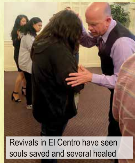
Revivals in El Centro have seen souls saved and several healed