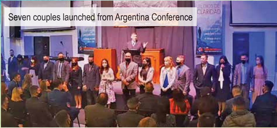
Seven couples launched from Argentina Conference