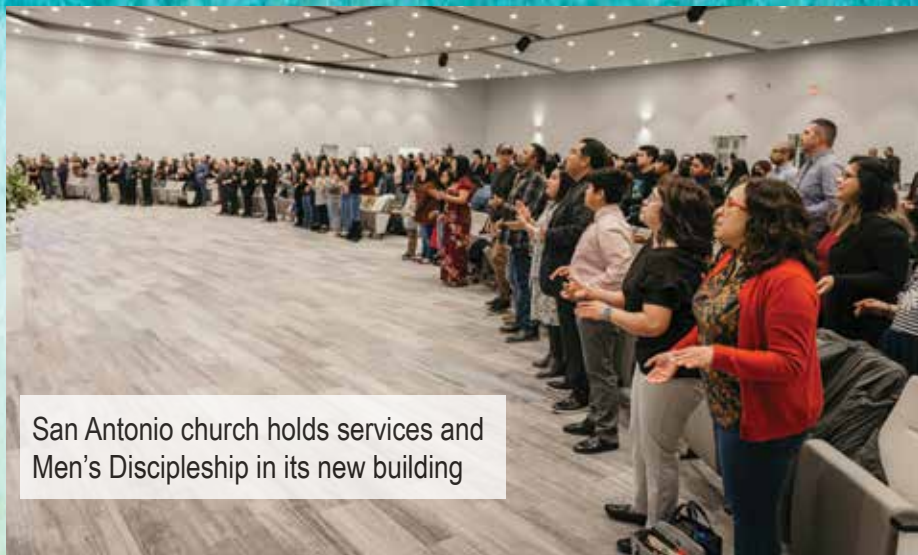
San Antonio church holds services and Men's Discipleship in its new building