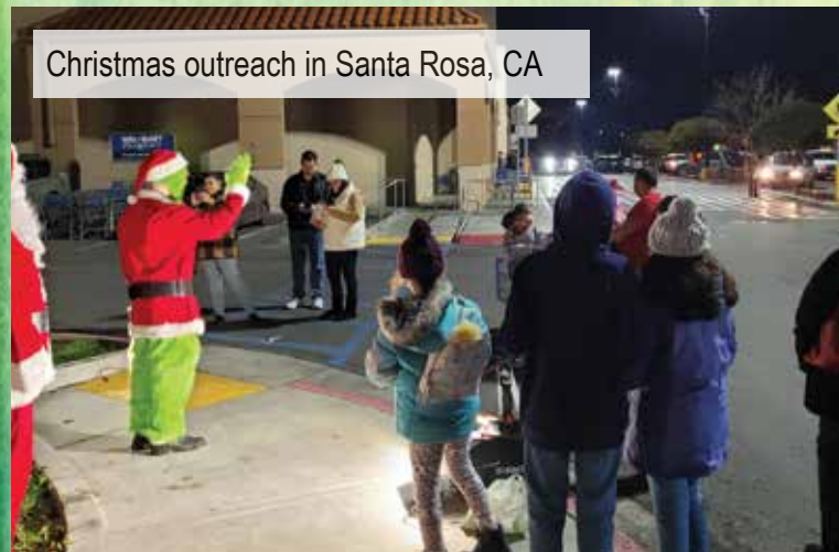
Christmas outreach in Santa Rosa, CA

We had four revivals in four months with timely preaching and words of knowledge spoken into lives. These services greatly encour-