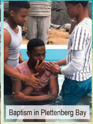
Baptism in Plettenberg Bay

touching people's hearts in Plettenberg Bay.