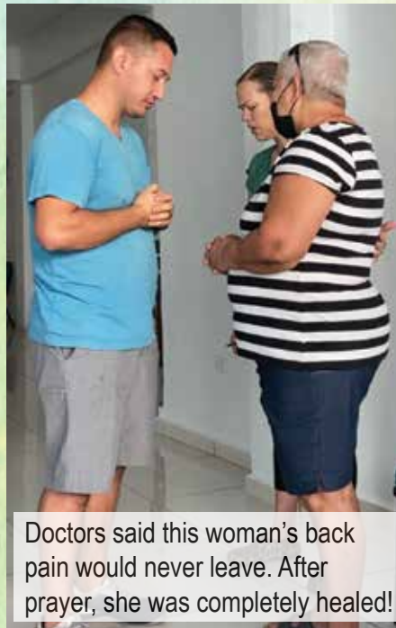
Doctors said this woman's back pain would never leave. After prayer, she was completely healed!

My family and I touched down on the island in August of 2021, and we are already seeing God open doors.