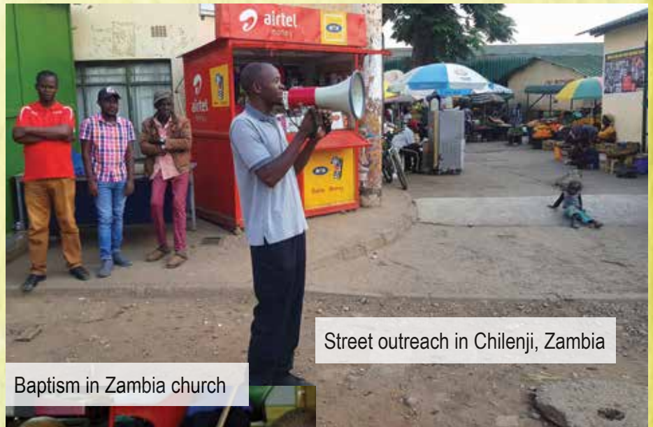
Street outreach in Chilenji, Zambia

What God has started in Waltham Forest this year has been a joy to witness and be a part of. We believe God is going to continue what he has started as we position ourselves for a last days revival. We thank you for your prayers. God bless.