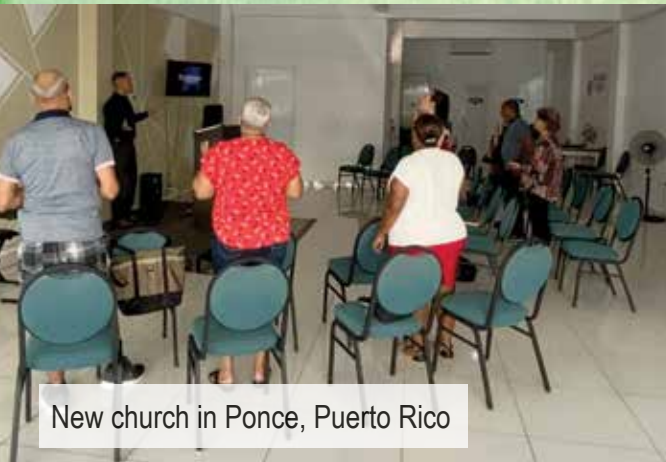
New church in Ponce, Puerto Rico