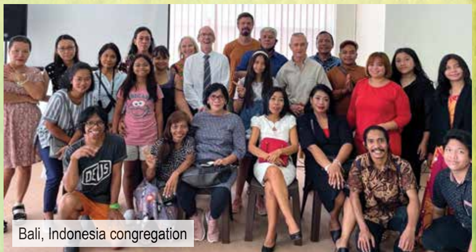
Bali, Indonesia congregation

We have services in both English and Indonesian, to reach all those who have ears to hear. Language has been a chal-