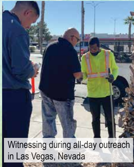
Witnessing during all-day outreach in Las Vegas, Nevada

Thank you so much for the prayers as our city is being impacted, we are still praying for you!