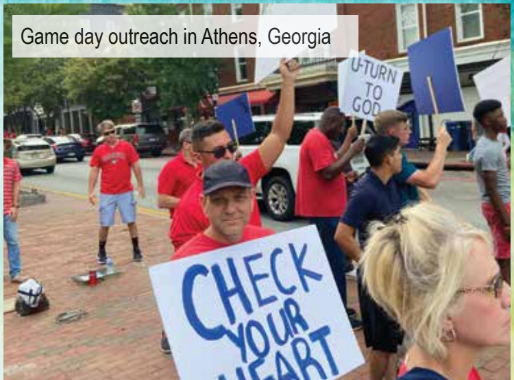
Game day outreach in Athens, Georgia

We were also able to reach our local community with our annual Trunk or Treat event. More than