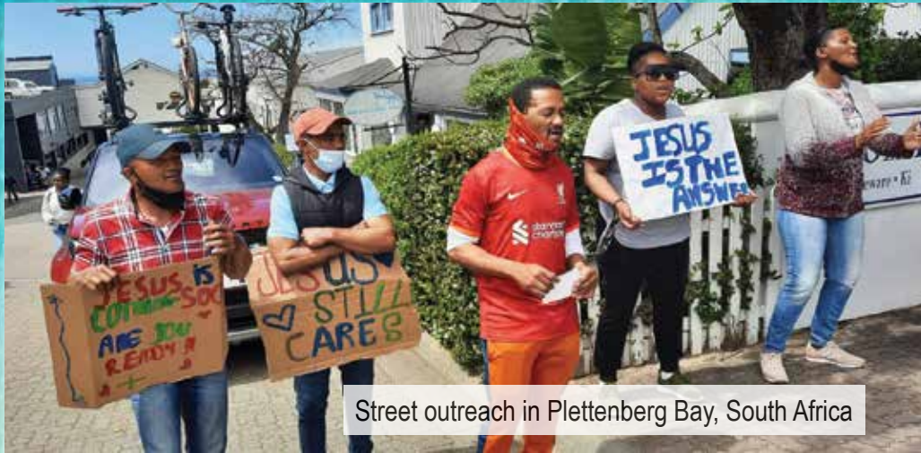
Street outreach in Plettenberg Bay, South Africa