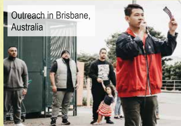
Outreach in Brisbane, Australia

a blessing in disguise, as he and his wife were supposed to take over the work in Ko-