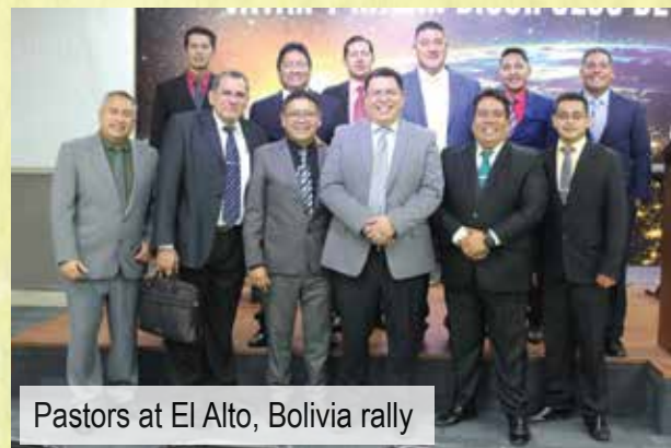
Pastors at El Alto, Bolivia rally

We are in desperate need to expand our building. And we are praying and trusting God for the finances to soon be able to do this. Please help us in prayer.