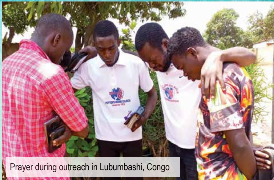
Prayer during outreach in Lubumbashi, Congo

We started our first service on the 12th of December and God has been