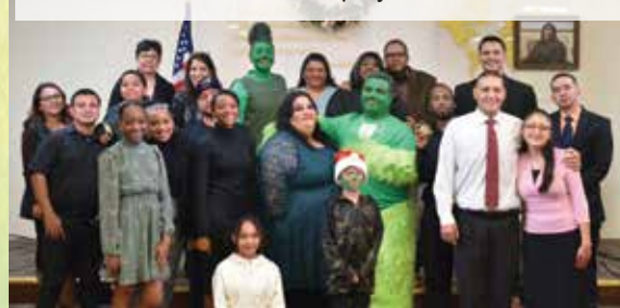
'Grinch on Trial' Christmas play in SW Houston, TX

lasting impression on the disciples of the church and congregation.