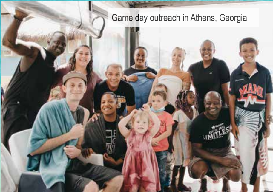
Game day outreach in Athens, Georgia