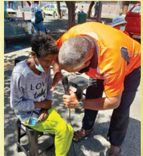
Prayer for the sick in Cape Town, South Africa outreach