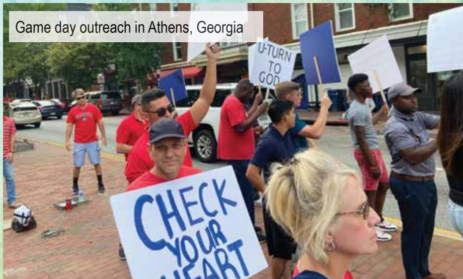
Game day outreach in Athens, Georgia

In November, we sent two couples out of the Tucson Bible Conference, planting churches in Winder and