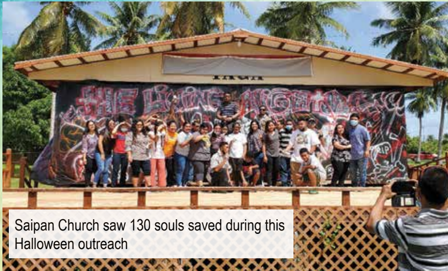
Saipan Church saw 130 souls saved during this Halloween outreach