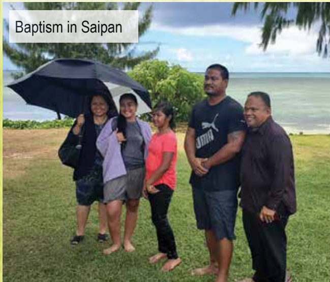
Baptism in Saipan

a blessing in disguise, as he and his wife were supposed to take over the work in Ko-