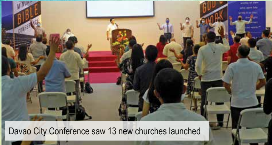
Davao City Conference saw 13 new churches launched

see visitors in most services and some have been attending faithfully even on Wednesdays.