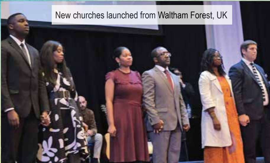
New churches launched from Waltham Forest, UK