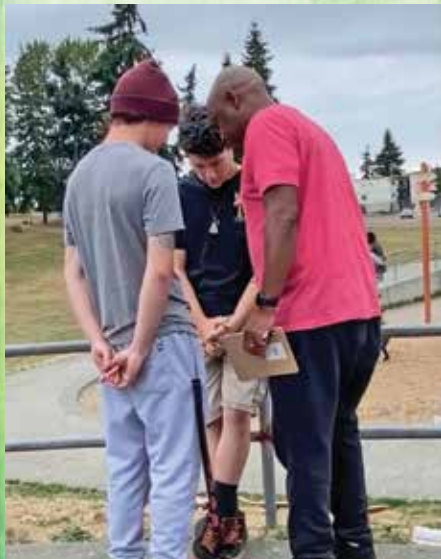
Souls saved during Everett, Washington outreach

we saw 56 first-time visitors with 14 souls won for Christ! A powerful piece of everything was that this was a completely “Disciple-led” Outreach! From the vision, to the organizing, to carrying out of it all!